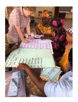
Subtraction and 100 square

Every teacher participating in GIVE workshops made a 100 square chart, a number line for classroom display and a set of number cards which they can use in a variety of ways within their classrooms.