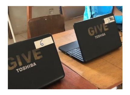
"GIVE" laptops in St. Peter's SC